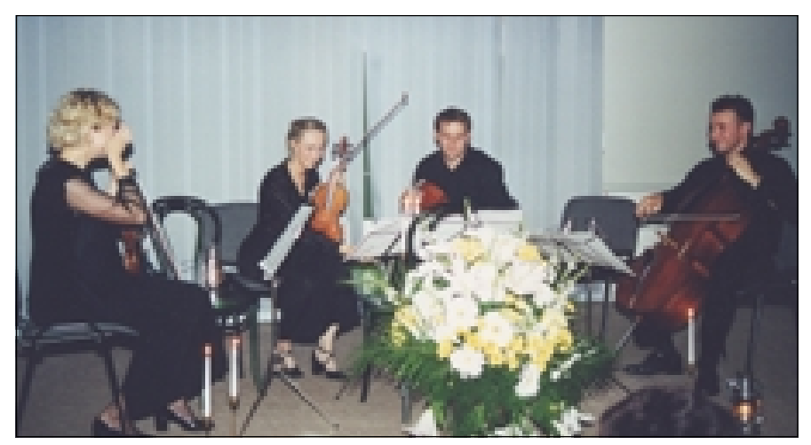
String Quartet by Candlelight

The members were notified in September, 1998 of this proposed change in the Constitution. A postal ballot at that time resulted in a less than the one fourth return of