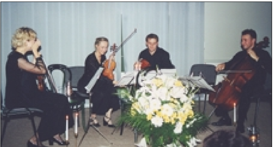
String Quartet by Candlelight

The members were notified in September, 1998 of this proposed change in the Constitution. A postal ballot at that time resulted in a less than the one fourth return of